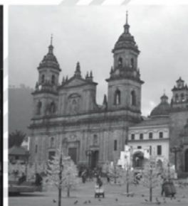
SANTUARIO DE MONSERRATE - BOGOTÁ